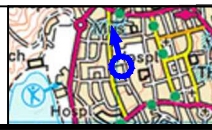
Figure 5.3.4b - Viewpoint 4: Gilbertson Park, Lerwick View flat at a comfortable arms length. The principal distance is 812.5mm. This image provides landscape and visual context only.