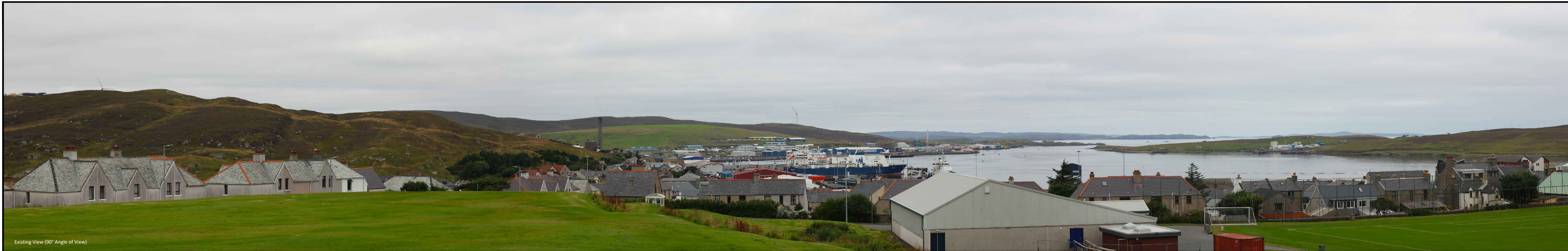
Existing View (90° Angle of View)