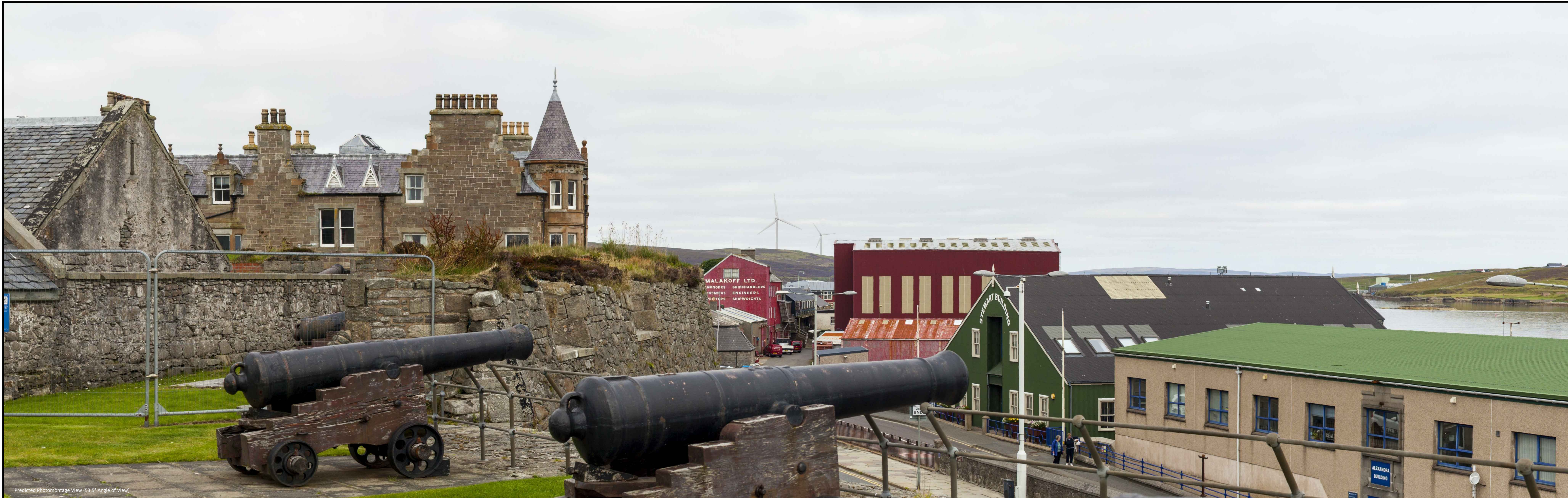
Predicted Photomontage View (53.5° Angle of View)