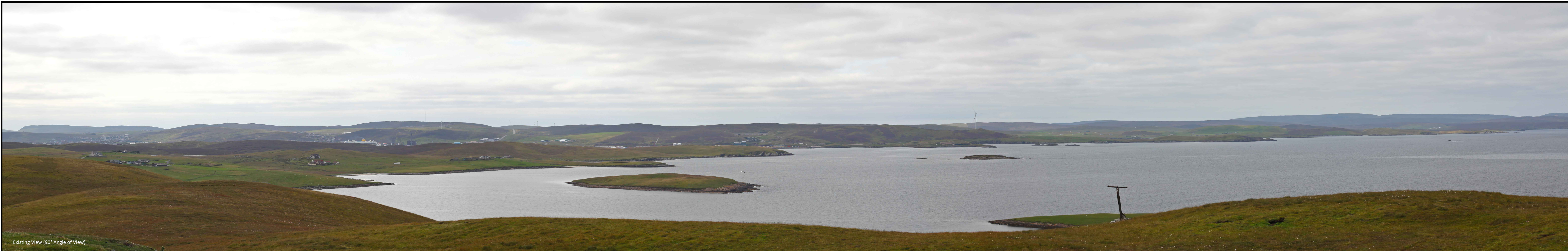
Existing View (90° Angle of View)