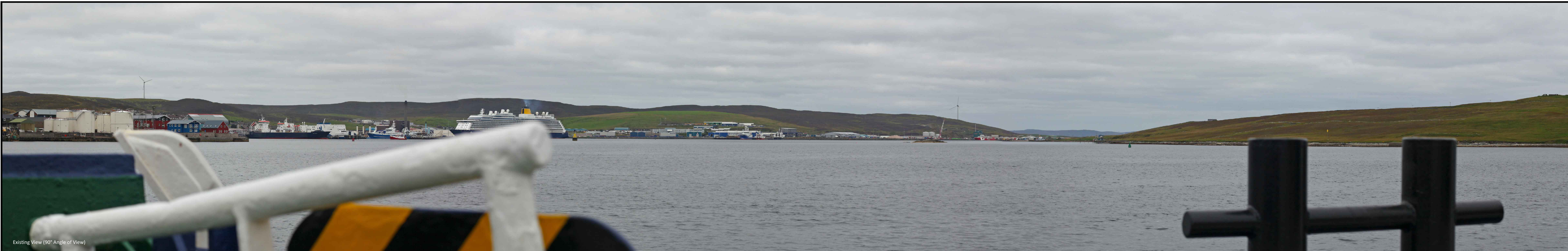
Existing View (90° Angle of View)